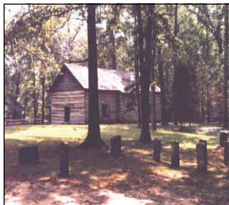
The Old Mulkey Meetinghouse

The second oldest log meeting house in Kentucky was built in 1804 during a period of religious revival. Many Revolutionary War soldiers and pioneers, including Daniel Boone's sister, Hannah, are buried here. The structure has twelve corners in the shape of a cross and three doors, symbolic of the Holy Trinity.